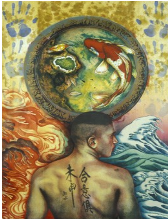
“Waiting for Moments of Gladness”, a 30” x 44” print, is in the collection of the Hawaii State Foundation on Culture and the Arts.